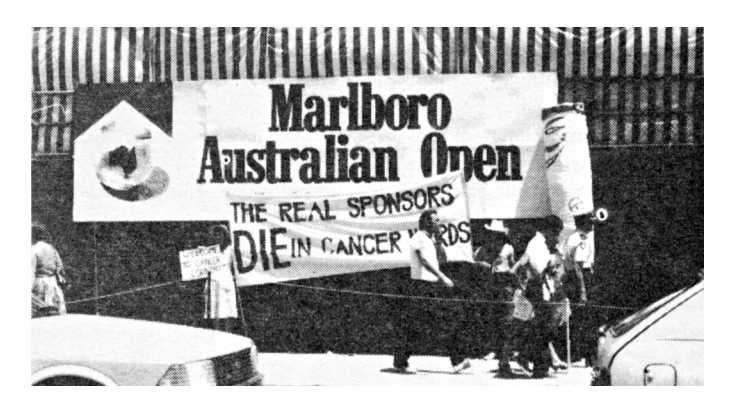
MOP UP protest outside the "marlboro open" finals

Irrespective of the motives, the happy outcome is that the L.T.A. found a more savoury sponsor immediately, putting paid to the tobacco sponsors' claim that sport cannot exist without them, and from 1985, the tobacco industry will have one less racket.