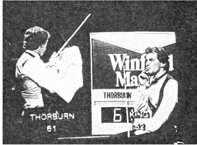
Advertising Of cigarettes on TV has been illegal since 1975. The ad in this recent broadcast is typical of those explained away as "accidental or incidental".

The League is also required to "assist rothmans in obtaining advertising space at the Sydney Cricket Ground, including the painting of the winfield logos on the grass playing area".