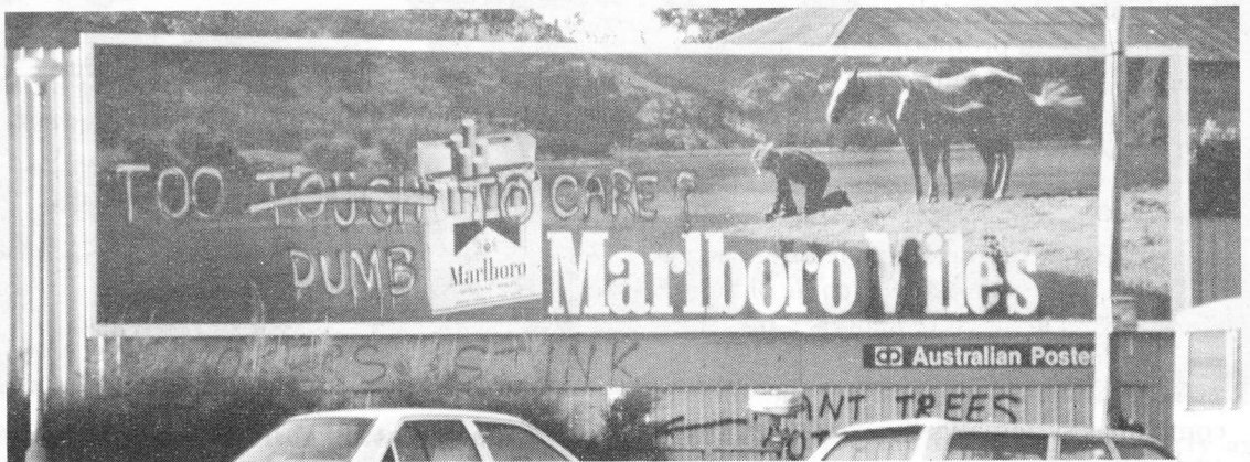
Images which appeal to children predominate in cigarette ads. This one has horses for the girls, and a cowboy for the boys.