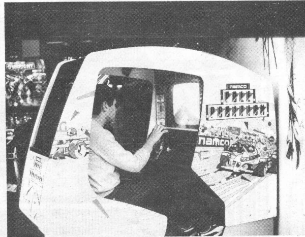
By indoctrinating children with brand names

Cigarette advertising cannot be seen as legitimately meeting a need, but as creating one.