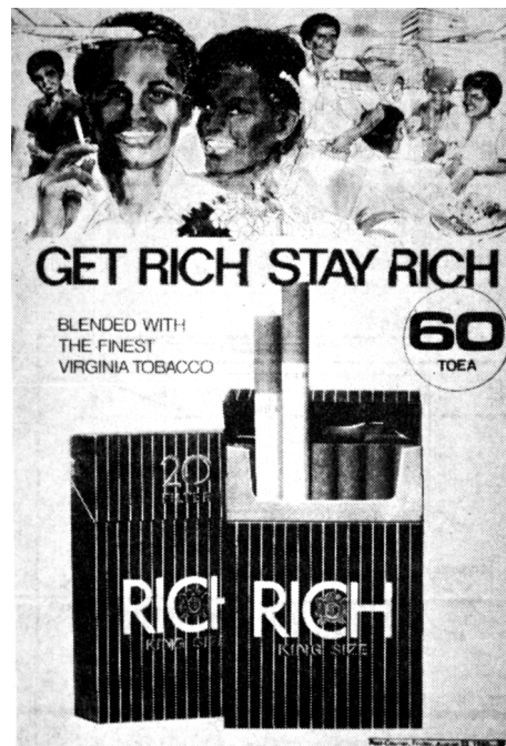
Tobacco advertising: contributing to third world prosperity.

As advertising bans and growing consumer awareness continue to impact sales of cigarettes in the developed countries, the drug pushers are setting their sights on the enormous potential of the Third World. With governments greedy for international trade and indifferent to possible long-term consequences, the highly sophisticated tobacco industry are having a field day promoting their wares using techniques which were outlawed elsewhere years ago.