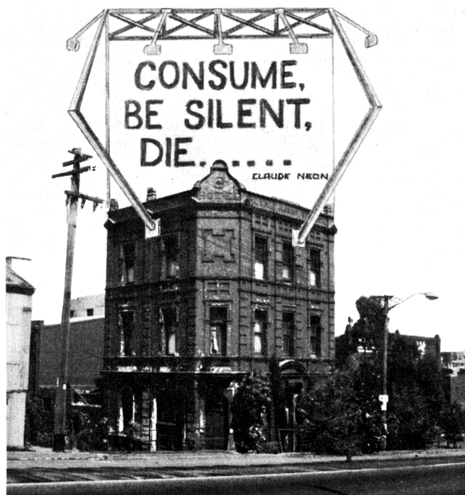
Graffitist's impression of the proposed sign in position.