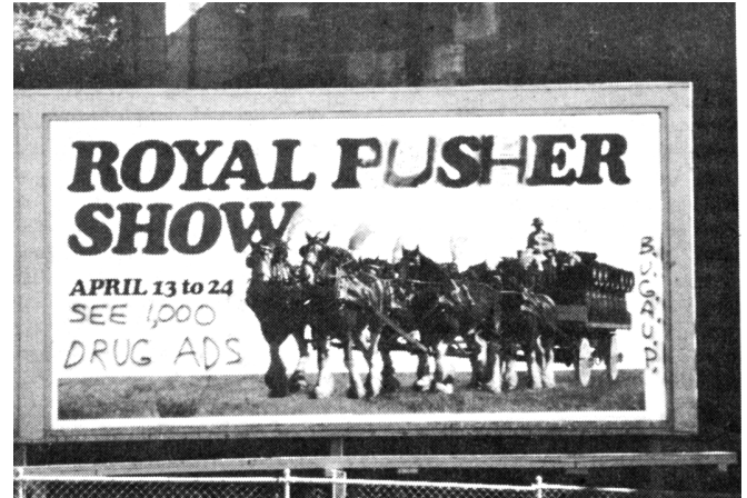
This year Carlton United Breweries, out of the goodness of their hearts, promoted the Royal Easter Show on their billboards.