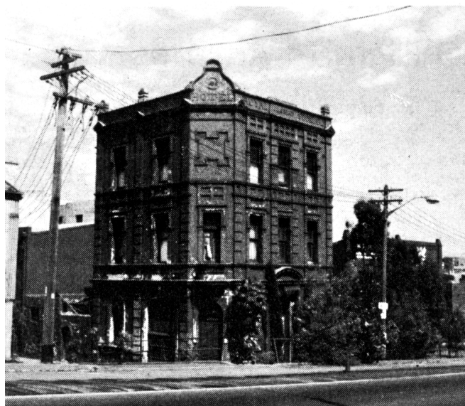
Royal Standard Hotel, built 1896

This ruling has set an important precedent for local councils who have so far felt impotent under the Local Government Act to prohibit billboard proliferation on aesthetic grounds. Several other Councils who have tried unsuccessfully to refuse planning permission are now gearing up to challenge rampant commercial interests on a broader, united front.