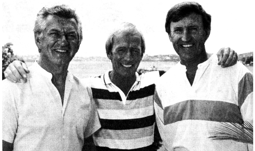
PRESENTING THE NEW OCKER IMAGE: (centre left to right:)

The number of children who smoke winfield and drink fosters is compelling testimony to the power of Hogan as a role model.