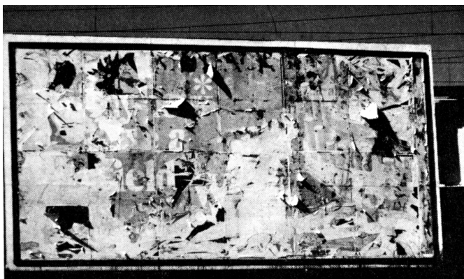
The same billboard today. A classic case of increasingly frequent post-operative complications.