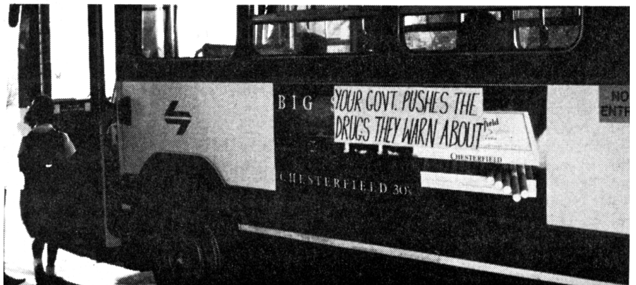
Two victims of a "bus strike"