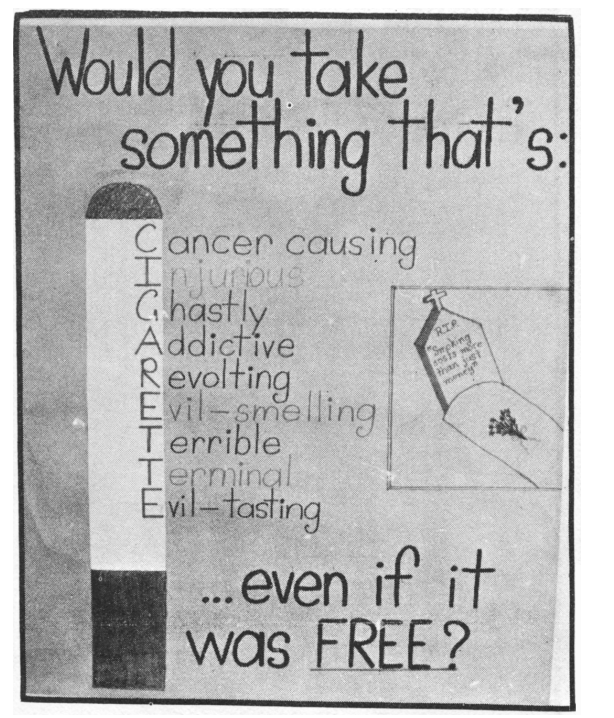
This entry in the N.S.W. Cancer Council's poster competition is a good example of how children marvel at the power of advertising.

The case attracted lots of favourable media coverage in the Sydney daily papers.