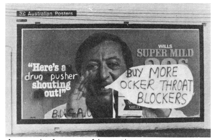
An example of a successful operation.

The end result of this melee was the two students were charged with "wilful damage to property, to wit a billboard", and will appear in court on 3 October to defend the charges.