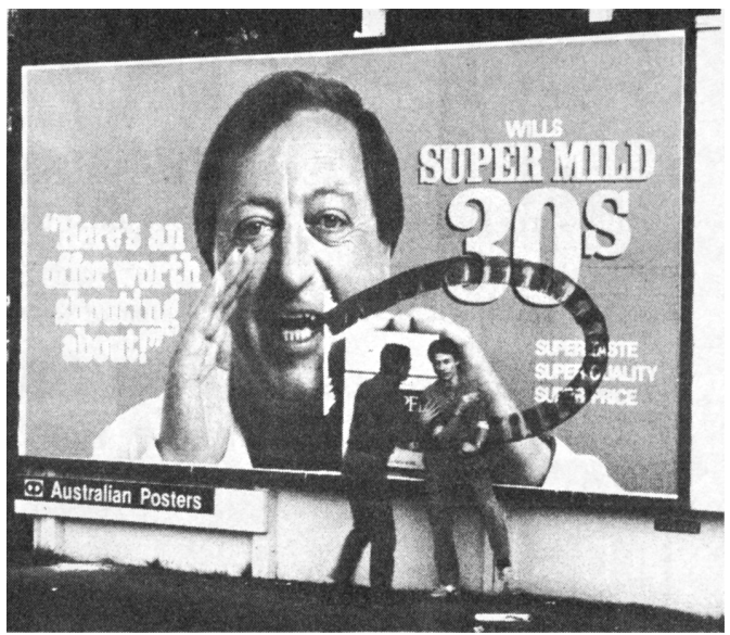
An innocent graffitist is jostled by an irate citizen.

When she appeared in court in early August, the prosecution complied with her request to change the charge to "malicious injury". The hearing of the new charge was adjourned until January 1985.