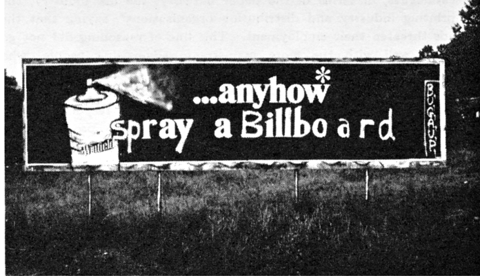
BUGA UP steps in to alleviate the SRA's problem with Heath's billboards